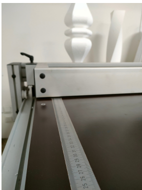
Ruler and adjustable stop