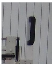
Handle to drive cutting wire

The return into the top position of the wire is done manually by the operator.